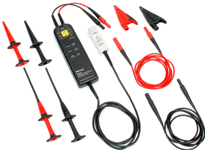
The P52xxA Series probes provide high-voltage differential measurement solutions for any oscilloscope.

Probes and accessories are not covered by the oscilloscope warranty and Service Offerings. Refer to the datasheet of each probe and accessory model for its unique warranty and calibration terms.