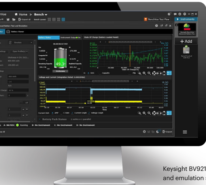
Keysight BV9211B battery test and emulation software

Note: The N6705C and N6700C support more than 50 modules that you can mix and match for various testing use cases. Battery emulation is only one of many supported use cases. The E36731A, in contrast, is optimized specifically for battery emulation and profiling.