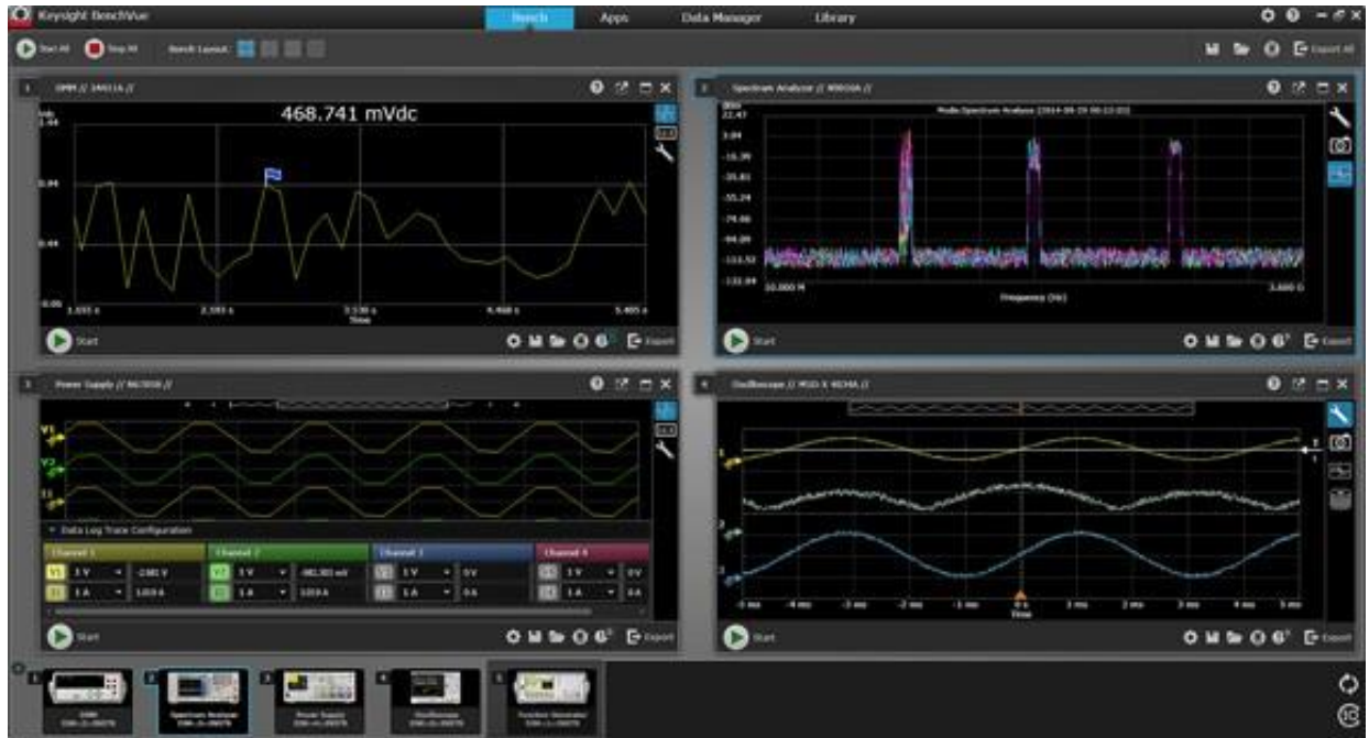
Figure 1. See your measurements across instruments in one place to quickly correlate measurement activities and obtain actionable insights.

With the companion BenchVue Mobile app, monitor and respond to long-running tests from anywhere. Download BenchVue software at no cost today at www.keysight.com/find/benchvue