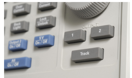
Figure 3. Simplifies Output 1 and Output 2 setup with tracking feature