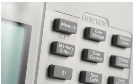
Figure 1. Output sequencing made easy with intuitive keypads

Both models of the U8030 series come with a set of features to suit your needs while remaining easy to use. The LCD screen displays both voltage and current readings in a one-view panel while the all ON/OFF button allows multiple outputs to be controlled simultaneously. Additionally, the auto-track feature simplifies setup between output 1 and output 2. With these, you get a solid bench power supply plus a set of convenient and easy to use features.