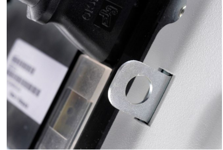
Physical lock mechanism as illustrated

Essential security features: Over-voltage protection (OVP)/ Over-current protection (OCP), keypad lock and physical lock mechanism