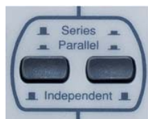
Internal connection for tracking Series and Parallel operation via control panel

In addition to independent output channels, the GPE-X323 series provides tracking series and parallel operation (For GPE-2323/GPE-3323/GPE-4323). The series and parallel connections allow power supplies to output 32V/6A (Parallel Connection) and 64V/3A (Series Connection).