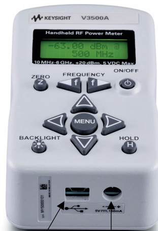
Figure 1. Signal connection

USB type Mini-B port for connection to PC