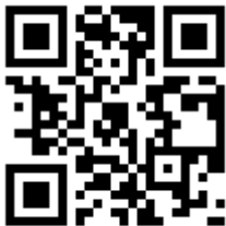
Figure 4-1: QR code to the Rohde & Schwarz support page

Contact our customer support center at www.rohde-schwarz.com/support , or follow this QR code: