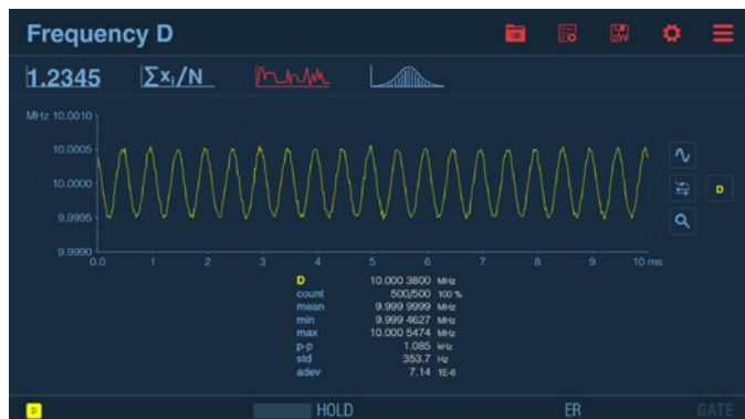
View fast FM, or any time/phase/frequency modulation, on screen, on one or more channels