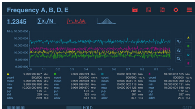
View 4 signals simultaneously on screen. 4 instruments in one!

Measured values are presented as both numerics and graphics. The graphical presentation of results (distribution, trends etc.) gives a better understanding of the nature of jitter. It also provides you with a much better view of changes vs time, from slow drift to fast modulation. The same data set can be viewed in Numerical, Statistics, Distribution and Time-line views. It is very easy to capture and toggle between views of the same data set.