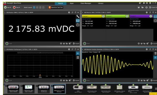
Figure 1. View measurements across USB DAQ, modular, and bench instruments all on one BenchVue interface.

The USB Modular DAQ App within BenchVue allows you to quickly configure and control any USB DAQ devices to perform data logging and visualize measurements. With six different display options, including grids and strip charts, zooming in to details the way you want is so much easier — so you can nail that measurement error in no time. You can also record measurements and export results to popular PC-friendly applications such as Microsoft Excel and Microsoft Word for further analysis in just a few clicks.