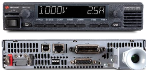
Figure 2. 1.5 kW model 1U 1/2 rack DP5721A