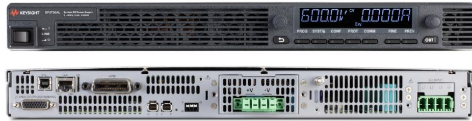
Figure 3. 3.4 kW, 5 kW, 7.5 kW model 1U full rack DP5756AL