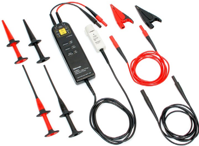
The P52xxA Series probes provide high-voltage differential measurement solutions for any oscilloscope.

Probes and accessories are not covered by the oscilloscope warranty and Service Offerings. Refer to the datasheet of each probe and accessory model for its unique warranty and calibration terms.