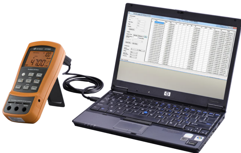
Figure 1. Automate the recording of continuous readings when you hook the U1731C/U1732C/U1733C to a PC

The handheld LCR meters allows you to test various component types, including secondary components of Dissipation Factor (D), Quality Factor (Q), and Angle Indication of Impedance ( \theta ). This new handheld series also includes other functions that result in a more detailed component analysis. For example, the built-in Equivalent Series Resistance (ESR) function helps you better understand the inherent resistance behavior typically found in capacitors across selected frequencies. DCR is a built-in DC resistance measurement that eliminates the use of a separate digital multimeter (DMM) for component test.