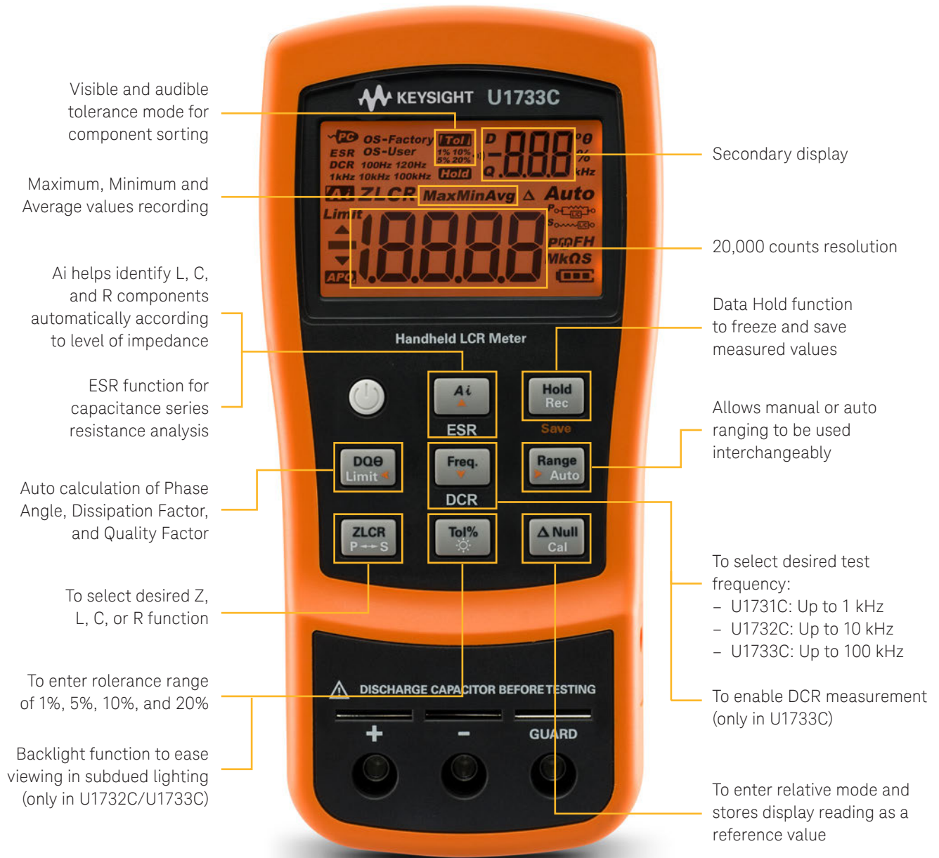
Figure 2. Front view of the U1733C