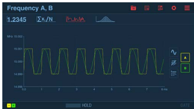
View fast FM, or any time/phase/frequency modulation, on screen, on one or two channels. Here we see FM modulation with both sine and square wave shape