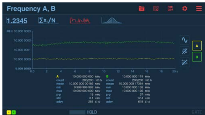
Compare 2 signals simultaneously on screen, with statistics parameters below. 2 instruments in one!

Measured values are presented as both numerics and graphics. The graphical presentation of results (distribution, trends etc.) gives a better understanding of the nature of jitter. It also provides you with a much better view of changes vs time, from slow drift to fast modulation. The same data set can be viewed in Numerical, Statistics, Distribution and Time-line views. It is very easy to capture and toggle between views of the same data set.