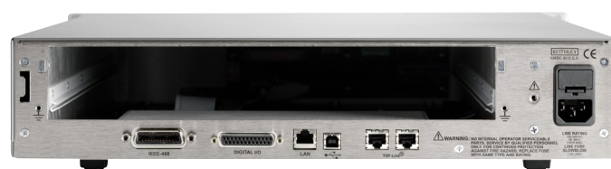
708B rear panel

Prefer to create your own customized application software? Native National Instruments Labview®, IVI-C, and IVI-COM drivers are available for downloading to simplify the programming process. For the Labview® driver please visit www.ni.com ; for IVI drivers please visit www.tek.com .