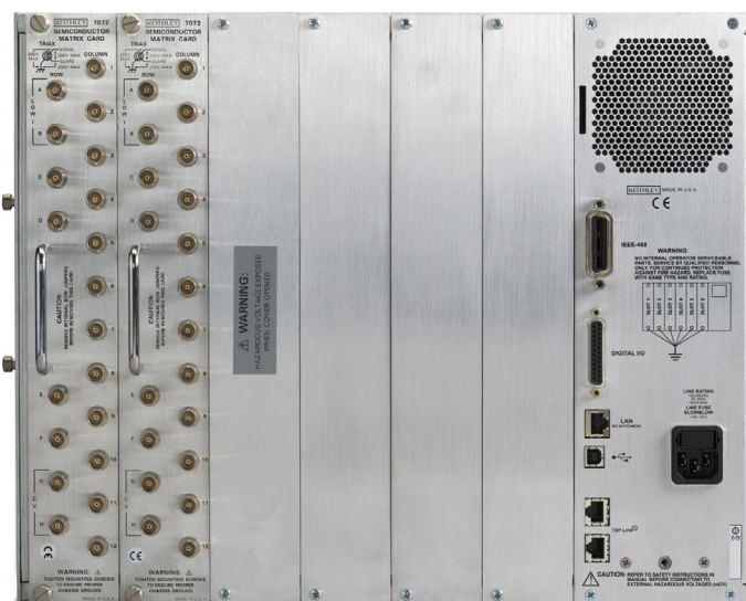
707B rear panel

The 707B and 708B are ideal companion products for systems that incorporate Series 2600B instrumentation, such as Keithley's ACS and S530 integrated test systems. These mainframes share the same TSP, Lua scripting language, and TSP-Link interface as the Series 2600B and support an ultra low current switch matrix (the 7174A) that complements the 2636B's low current sensitivity. The 707B/708B offer test system builders a switch matrix that is fast, scriptable, and works seamlessly with all Series 2600B models.