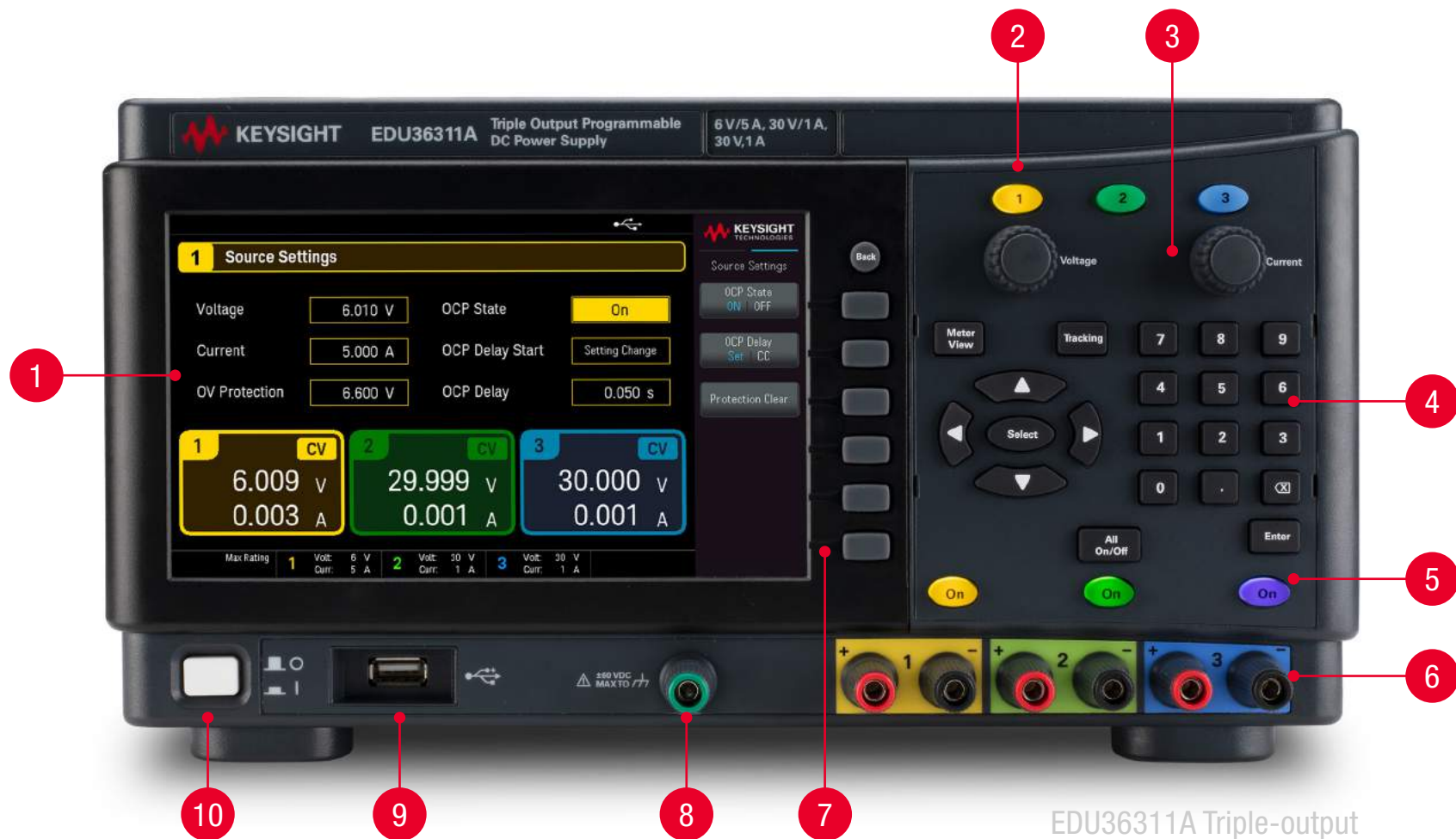
EDU36311A Triple-output Programmable DC Power Supply