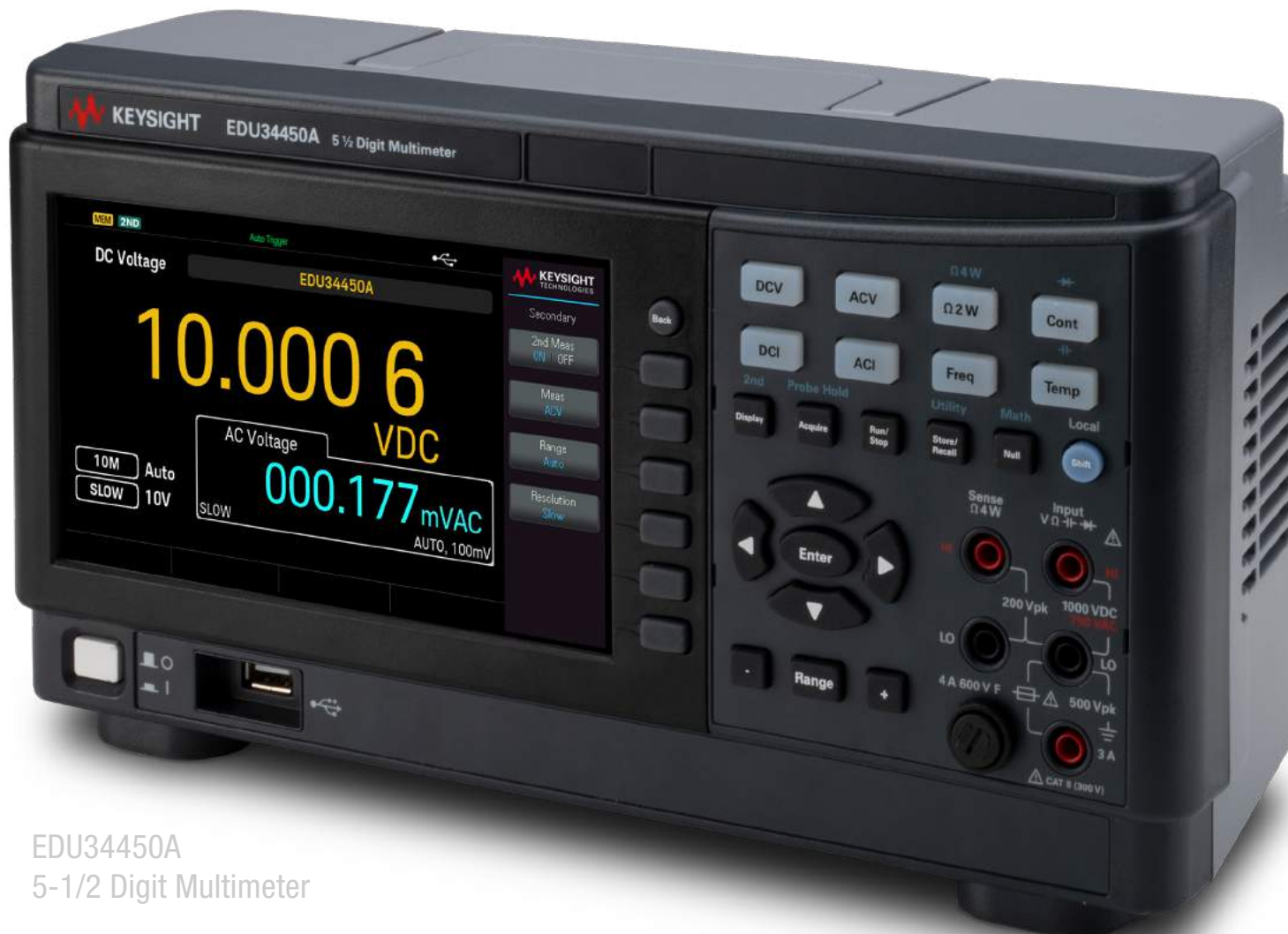
EDU34450A 5-1/2 Digit Multimeter