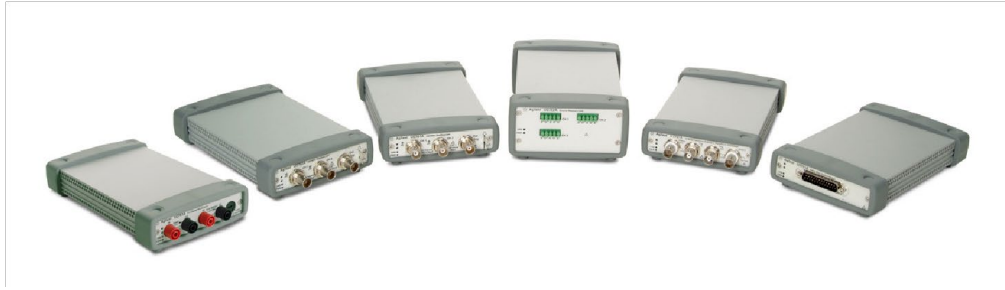
Figure 1. Keysight's USB Modular Instrument (MI) family

The next time you're called out to solve tough problems in electronic products or processes, leave the bulky transit cases behind. With Keysight Technologies, Inc.'s USB modular instrument (MI) family, you can easily carry powerful test gear in your bag along with your laptop PC. Our line of MIs includes two oscilloscopes, a DMM, a function generator with arbitrary waveform capability, a source/measure unit and a 4x8 switch matrix. All provide USB 2.0 connectivity (with USBTMC-USB488) standard and plug-and-play simplicity for easy use on the go or on the bench.