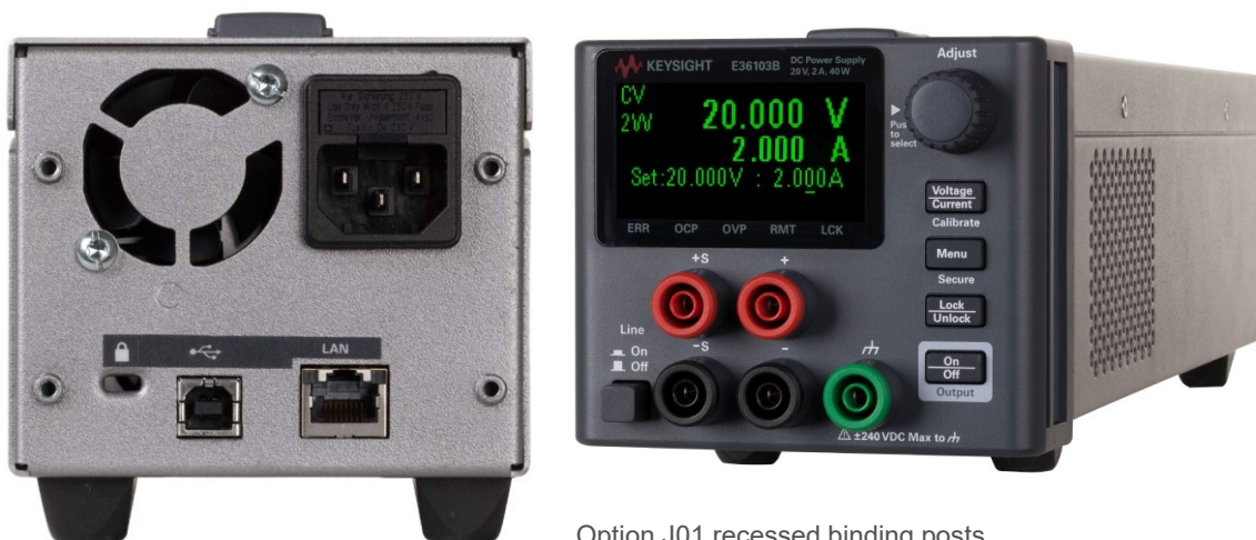
Option J01 recessed binding posts

Connect for computer control with standard LAN (LXI Core) and USB connectivity. Use the security slot to keep the supply on your bench.