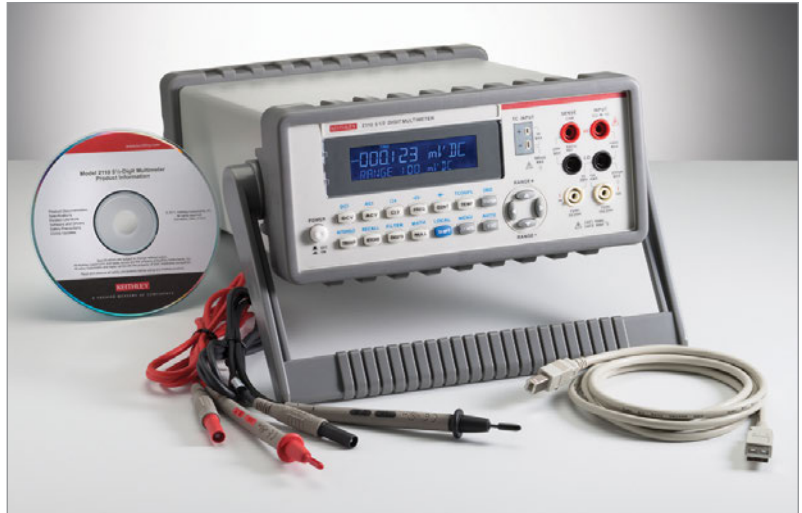
All accessories, such as start-up software, USB cable, power cable, and safety test leads, are included with the 2110.

LabView, IVI-C, and IVI-COM drivers are also supplied to allow for increased flexibility in integrating the 2110 into new and existing systems and test routines.