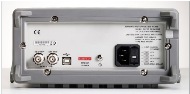
2110 rear panel.