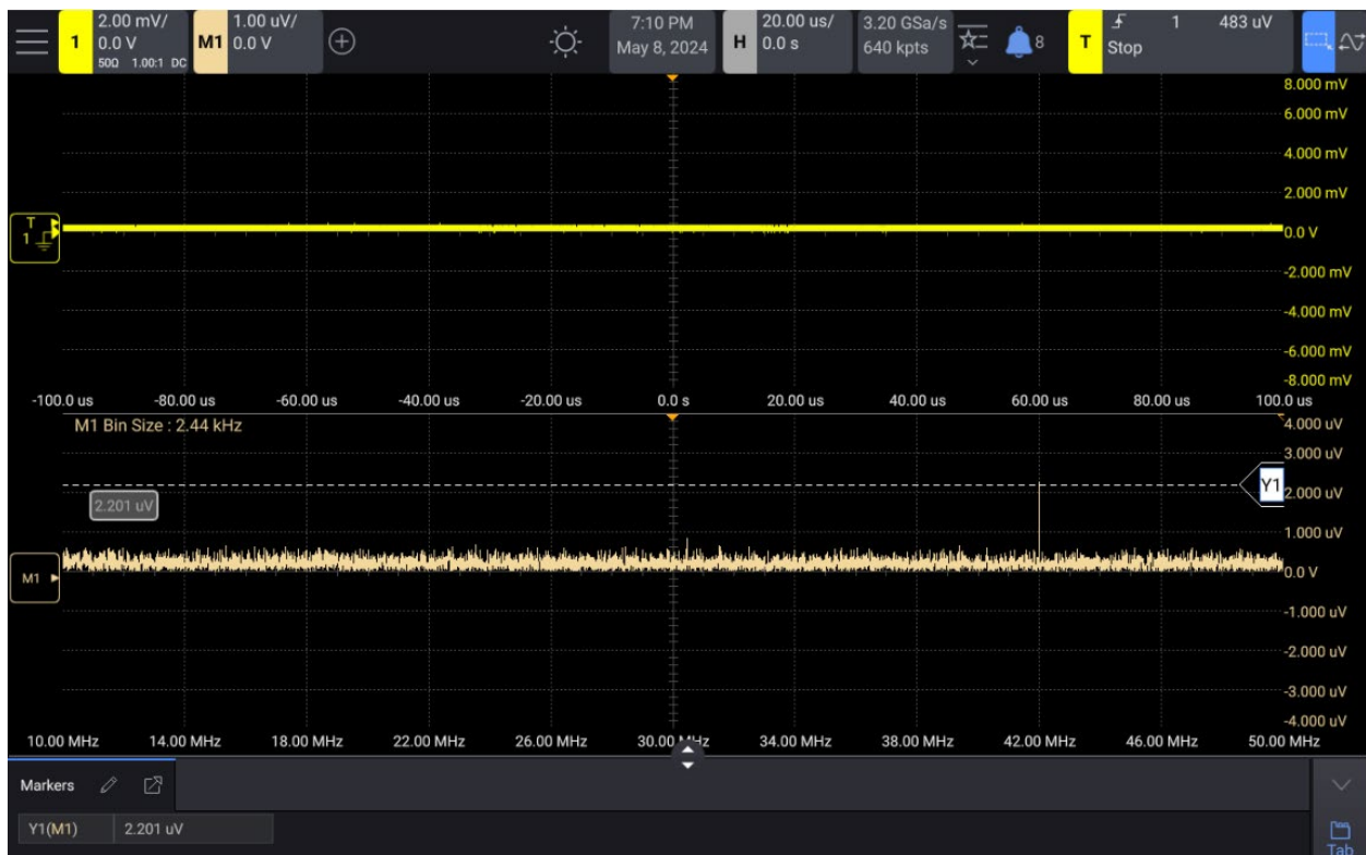
Figure 1. The oscilloscope captures a 2 \mu\text{V} , -100 dBm signal very clearly in our FFT. This same signal would not be viewable with a higher noise floor oscilloscope.

You can achieve even greater accuracy (5x better) with up to 16 bits of resolution using the built-in per-channel bandwidth filters. Need to use the full bandwidth to 1 GHz? You will still get extremely high accuracy at the full bandwidth, with the ability to zoom to 100 \mu\text{V}/\text{div} .