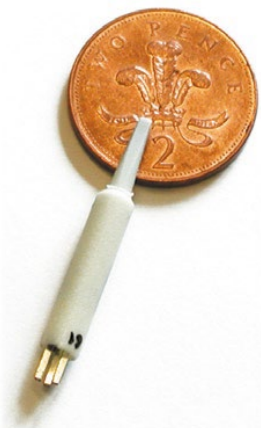
The illustration shows the main part of the magnetometer. The field sensing element is of sub-millimetre dimensions and is placed at the tip of the sensor.

This enables it to use an excitation frequency of several tens of MHz resulting in a sensor with a bandwidth of dc to 5MHz combined with low noise and wide dynamic range.