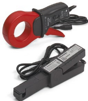
Illustration shows high performance current probes from Tektronix Inc.

Normally the probe provides a method of mechanically splitting the magnetic circuit to enable the conductor to be inserted. The position of the conductor within the loop has relatively little effect upon the measurement.