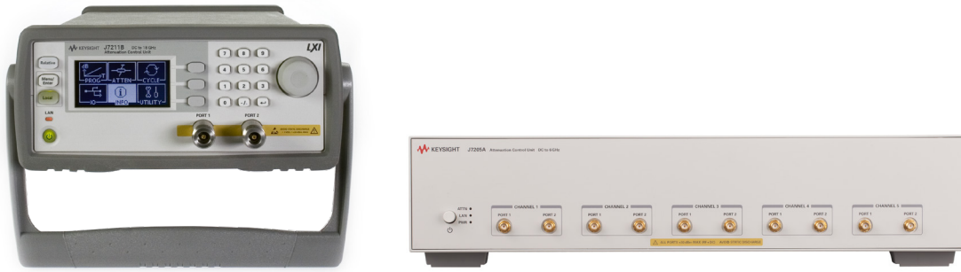
Figure 5. Attenuator control unit.