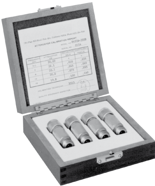
Figure 7. Coaxial fixed attenuator set.

Sets of four coaxial fixed attenuators with attenuations of 3, 6, 10 and 20 dB are provided in a walnut accessory case. These sets are ideal for calibration labs or where precise knowledge of attenuation and SWR is desired.