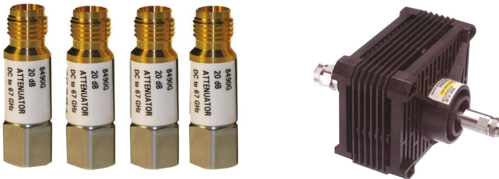
Figure 2. Coaxial fixed attenuators.

Keysight coaxial fixed attenuators provide precise attenuation, flat frequency response and low SWR over broad frequency range. These attenuators are available in nominal attenuations of 3, 6, 10, 20, 30, 40, 50 and 60 dB to cater to various applications and setups.