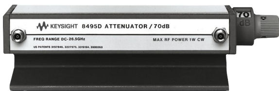
Figure 3. Manual step attenuators.

Keysight manual step attenuators offer fast, precise signal-level control up to 26.5 GHz. Unmatched attenuation repeatability of less than 0.03 dB up to 5 million cycles per section ensures low measurement uncertainty. Attenuation range of 121 dB in 1 dB step can be achieved by cascading 2 attenuators in series.