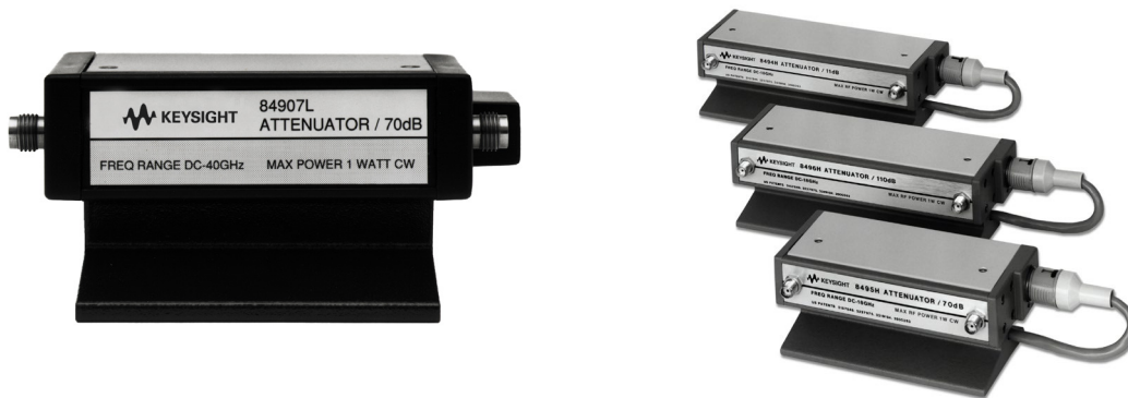
Figure 4. Programmable step attenuators.

Keysight programmable step attenuators offer fast, precise signal-level control up to 50 GHz, with switching time of less than 20 ms. Unmatched attenuation repeatability of less than 0.03 dB up to 5 million cycles per section ensures low measurement uncertainty and reduces calibration cycles when installed into test systems. Automatic GPIB/USB/LAN drive control is achieved with the 11713B/C attenuator/switch driver.