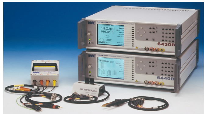
Accurate component analysis to 500 kHz (6430B) or 3 MHz (6440B) is simplified by many accessories which includes Overload Protection Unit 1J1100

The protection unit will protect the test equipment from up to 25 Joules of charged energy.