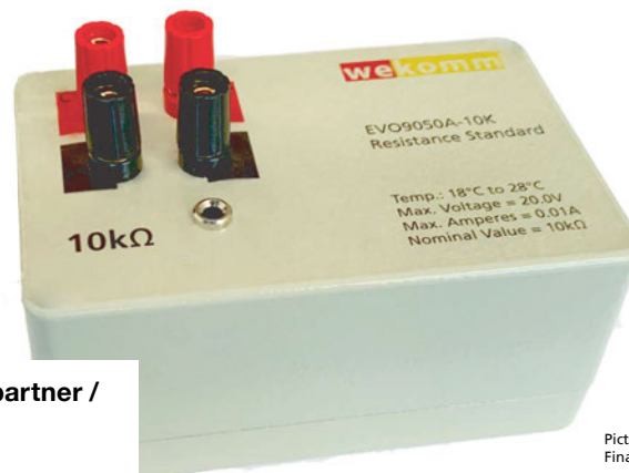
Picture shows a prototype device. Final product might differ