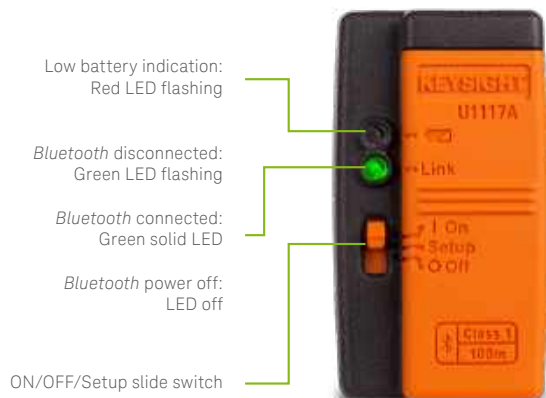
Figure 4. The U1177A as illustrated