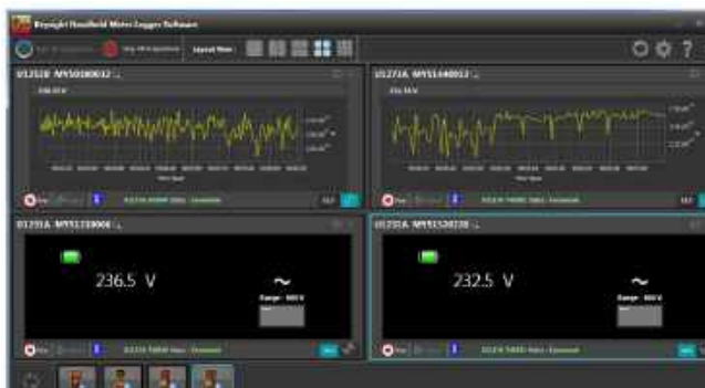
Figure 13. View up to 10 handheld meters readings or trendings with Keysight Handheld Meter Logger software

The Remote Link solution also supports data logging and monitoring activities on a Windows PC via downloadable Keysight Handheld Meter Logger software.