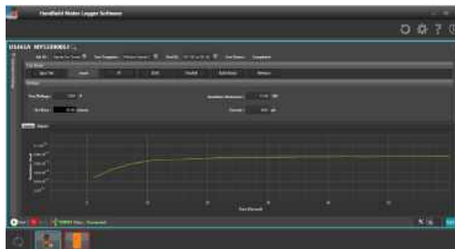
Figure 14. View insulation resistance test trendings and generate test report on a Windows PC

The Keysight Handheld Meter Logger software is a free software compatible with the U1210 Series, U1230 Series, U1240 Series*, U1250 Series, U1270 Series, and U1450A/U1460A**.