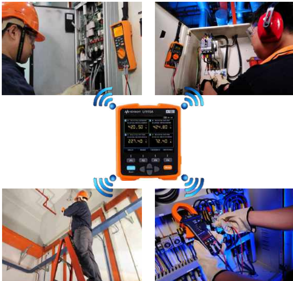
Figure 8. Monitor up to four handheld meters readings at once with the U1115A remote logging display

* All images shown are for illustration purposes only