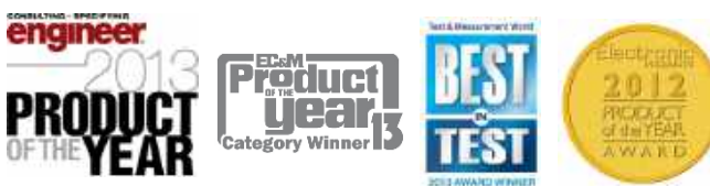
Figure 6. Multiple awards winning U1177A Infrared (IR)-to-Bluetooth adapter is being recognized as an innovative solution in Test & Measurement industry