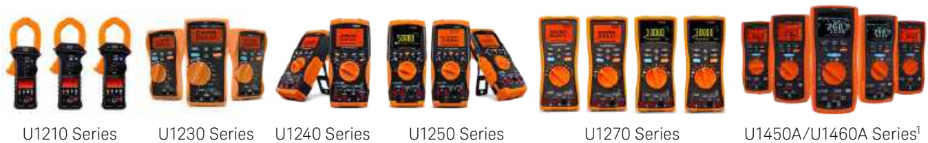
Figure 1. Communicate via Bluetooth to all existing Keysight U1200 series handheld meters, including the U1450A/U1460A series insulation resistance testers 1

The Remote Link is able to communicate via Bluetooth to 20 Keysight U1200 Series handheld meters, including the new U1450/U1460A Series insulation resistance testers. 1 Now you can save investment cost by using existing Keysight handheld meters that you have already owned. The wide selection of handheld meters cater to various application needs to get real-time measurements from a basic, compact and low cost handheld meters.