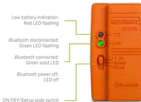
Figure 5. The U1177A as illustrated