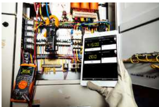
Figure 2. Monitoring handheld multi-meter and clamp meter readings remotely via iOS/Android based smart devices

* Needs a U1179A IR bracket – sold separately as an accessory