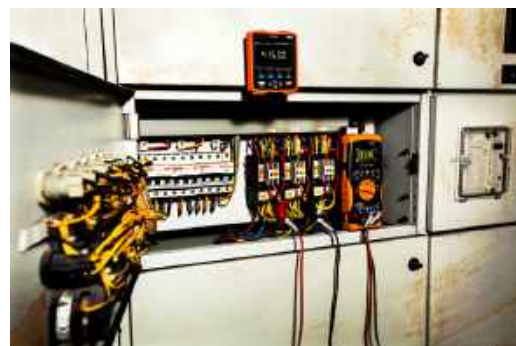
Figure 3. Monitoring handheld meter readings via the U1115A remote logging display