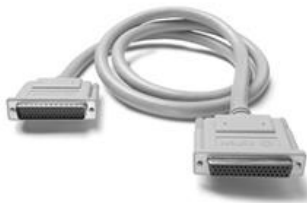
Standard Dsub cable

With 19 different plug-in modules in low frequency, RF and microwave switching to 20 GHz, digital I/O, D/A converters, and counter/totalizer functionality, the 34980A has the core switch/measure functionality needed for most automated test and data acquisition applications. The 34980A can accommodate up to 560 2-wire MUX or 1024 2-wire matrix crosspoints in one mainframe.