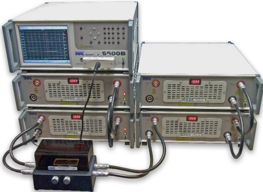
Typical 120 MHz 40 A DC Bias Current System (using 65120B, 4 x 6565-120 and 1027 Fixture)