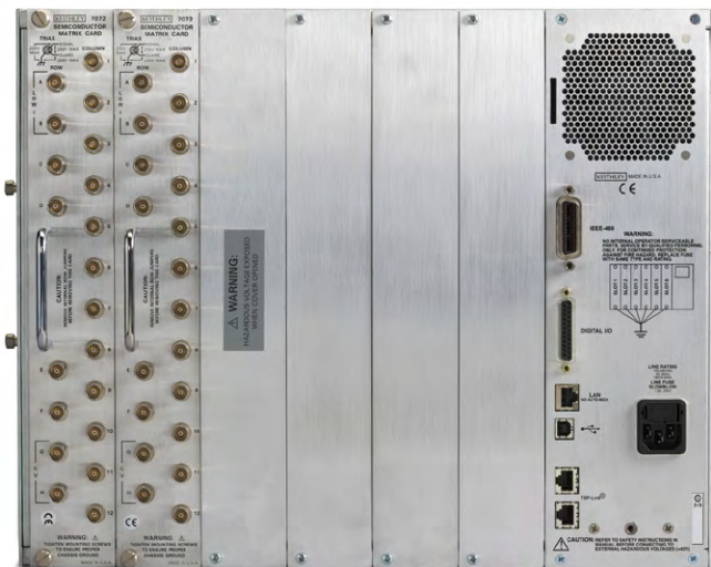
707B rear panel

Prefer to create your own customized application software? Native National Instruments Labview®, IVI-C, and IVI-COM drivers are available for downloading to simplify the programming process. For the Labview® driver please visit www.ni.com ; for IVI drivers please visit www.tek.com .