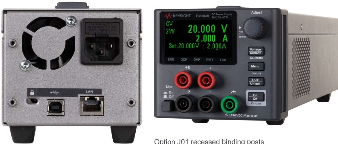
Option J01 recessed binding posts

Connect for computer control with standard LAN (LXI Core) and USB connectivity. Use the security slot to keep the supply on your bench.