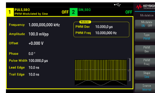
PWM modulated with standard sine wave