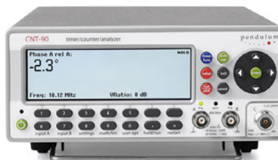
Figure 1: Display showing phase value, frequency, attenuation Va/Vb, and auxiliary parameters.

When adjusting a frequency source to given limits, the graphic display gives fast and accurate visual calibration guidance.