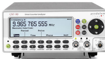
Figure 2: Measure function selection menu, shown with measured results.