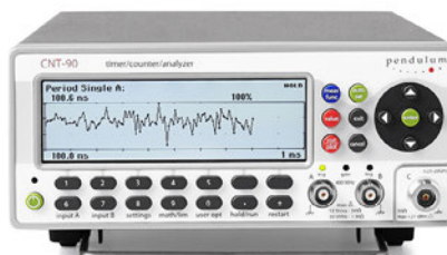
Figure 5: Display showing the trend (signal over time) of sampled data.