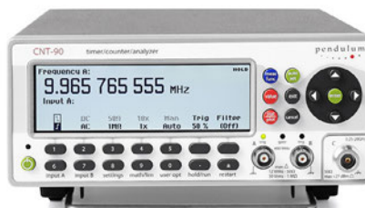
Figure 3: Input parameter setting menu shown with measured result.