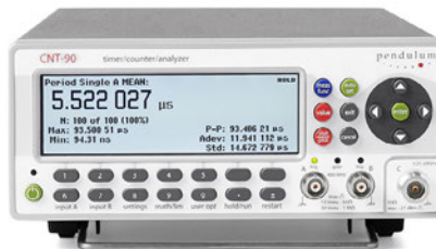
Figure 4: Display showing different statistical parameters viewed at the same time.