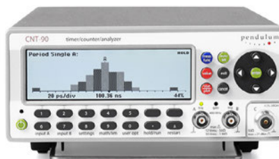
Figure 6: The same result as in Figure 5, now displayed as a histogram.