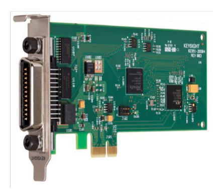
82351B with standard profile bracket