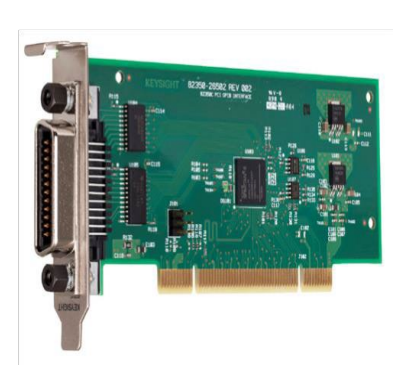
82350C with low-profile bracket